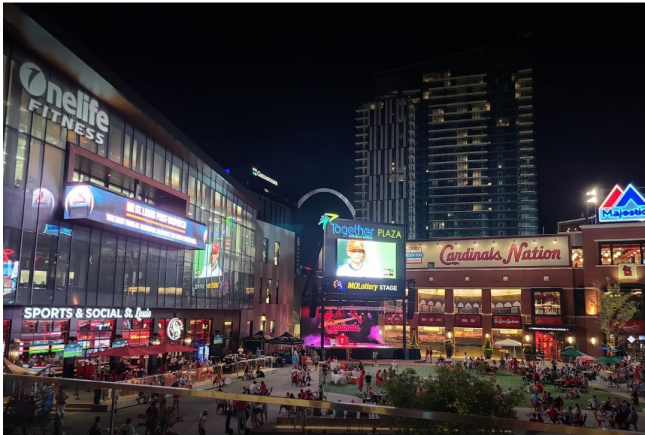
This will be your view of Busch Stadium during the Opening Reception Wednesday night!

Join us in 2021 in St. Louis September 21-24 Live by Loews