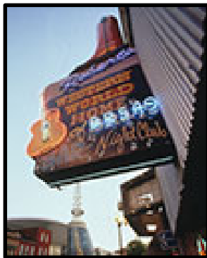
One of Nashville's Famed Honky-Tonks