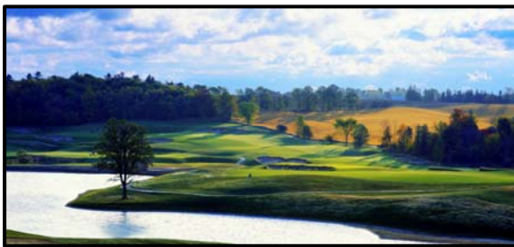
The Club at Bond Head