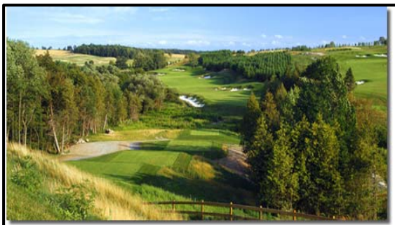
The Club at Bond Head